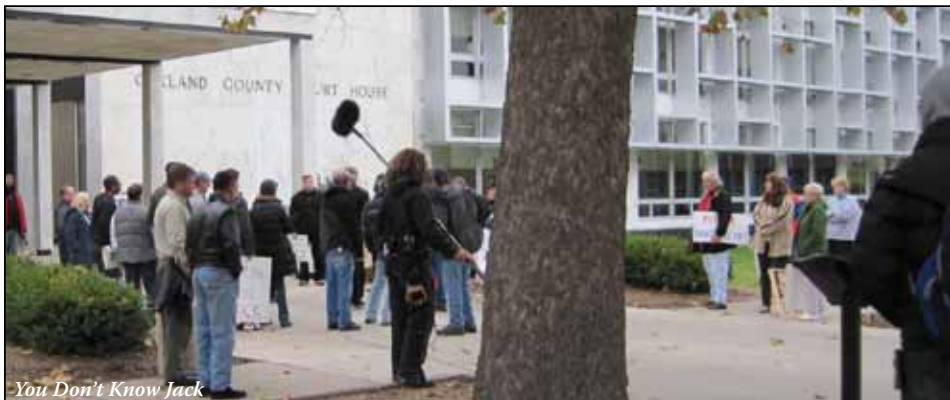
You Don't Know Jack