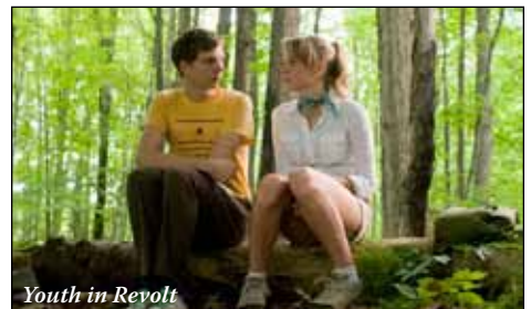
Youth in Revolt

Up in the Air , starring George Clooney and directed by Jason Reitman, will be released by Paramount Pictures on December 4 in limited release, with expanded release on December 18 and 25.